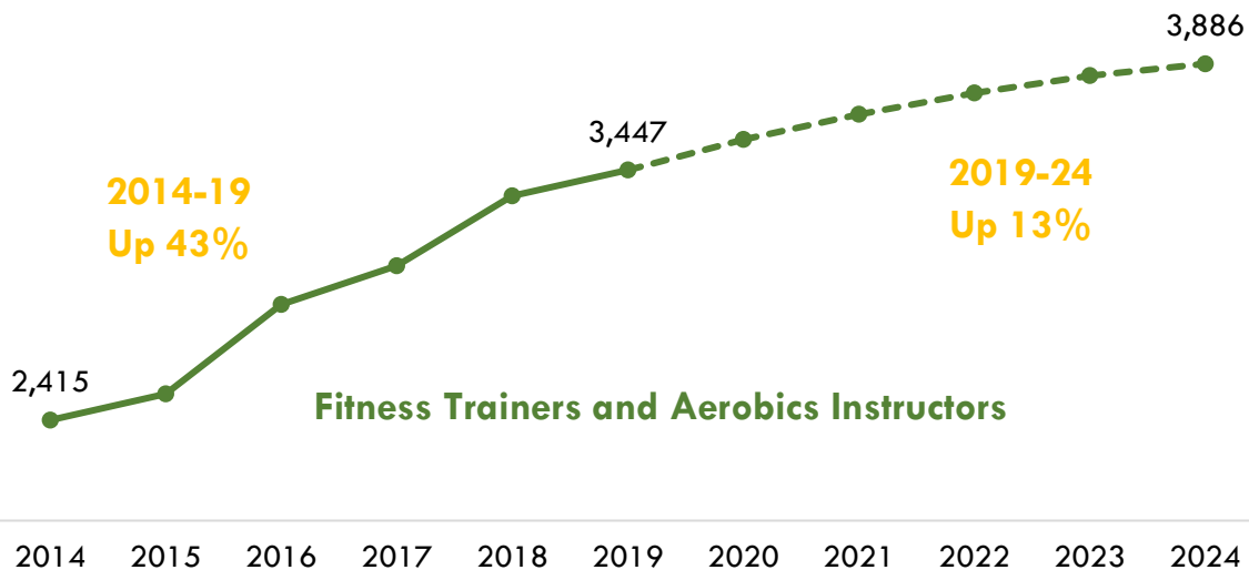
Exhibit 2: Historical and projected jobs in the IEDR, 2014 – 2024